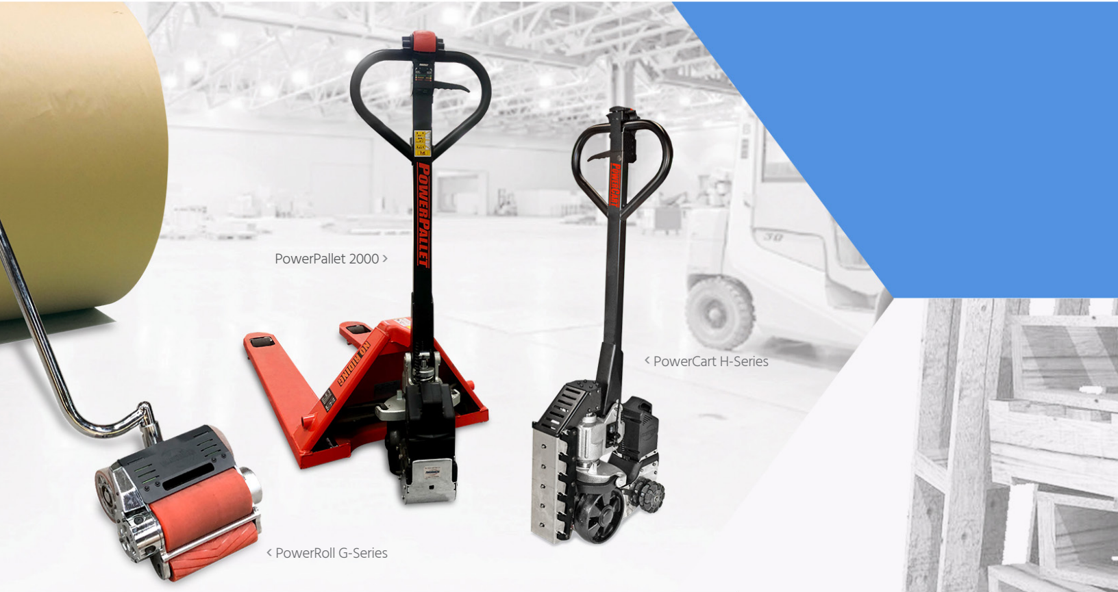
PowerPallet 2000 >